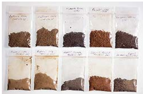
Dried samples of undisturbed soil (top row) and material left after extractable organic matter has been removed (bottom row). Although minerals are the most abundant components of soil, organic matter gives it life and health. Soil samples from left to right are from Maryland, Nebraska, Georgia, and Colorado. (K9974-1)