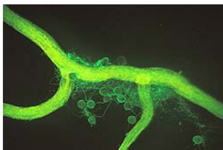
A microscopic view of an arbuscular mycorrhizal fungus growing on a corn root. The round bodies are spores, and the threadlike filaments are hyphae. The substance coating them is glomalin, revealed by a green dye tagged to an antibody against glomalin. (K9968-1)

As a glycoprotein, glomalin stores carbon in both its protein and carbohydrate (glucose or sugar) subunits. Wright, who is with the Sustainable Agricultural Systems Laboratory in Beltsville, Maryland, thinks the glomalin molecule is a clump of small glycoproteins with iron and other ions attached. She found that glomalin contains from 1 to 9 percent tightly bound iron.