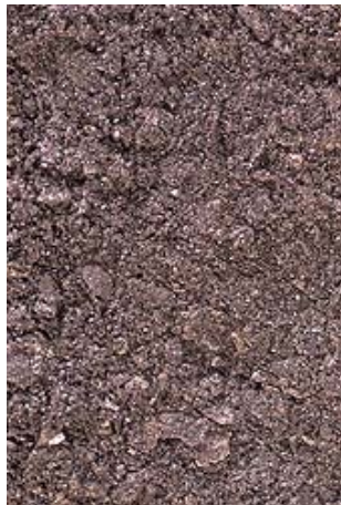
Glomalin, extracted from undisturbed Nebraska soil and then freeze-dried. (K9969-2)

A sticky protein seems to be the unsung hero of soil carbon storage.