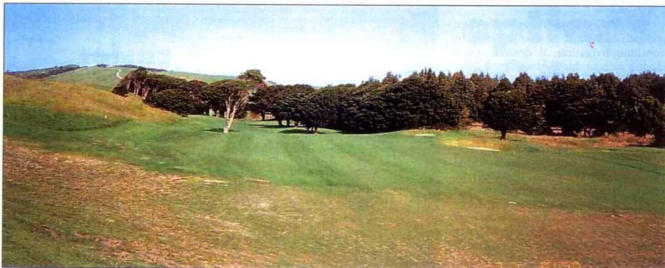
Sub-surface drip irrigation has been installed in the mown section of this fairway at Omaha Beach Golf Course, New Zealand. The system is used to dispose of treated effluent water from a new housing development.

to proceed at any time, even while the golf course is in use;