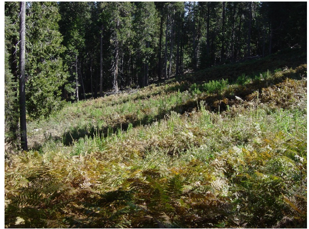
Tenaya Lodge with vegetative growth over drip lines

Increased organic plant matter in the soil from biological activity improves soil conditions for plant growth, provides continual food and moisture for plant life and adds pore space for pathogen destruction. The air in soil is rich in carbon dioxide which is vital for the photosynthesis of plants. Plant roots take up water limiting what can reach groundwater.