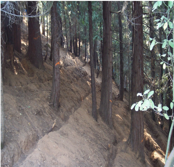
Geoflow Installation lines at Yosemite West

The Regional Water Quality Control Board mandated the Yosemite West owners to upgrade within four phases. The final phase was to provide seven acres of subsurface drip disposal. Two and a half acres were placed on existing terraces and 4.5 acres were installed on steep slopes ranging from 40 to 60 % gradient. To install sub surface drip lines around large redwoods, forty laborers in three crews hand dug and installed the lines and boxes. Site inspection in October 2006 revealed no surfacing and no overland flows.